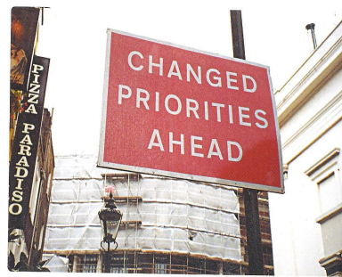
Left lane for mid-life crisis; right lane for abandoning New Year's resolutions.